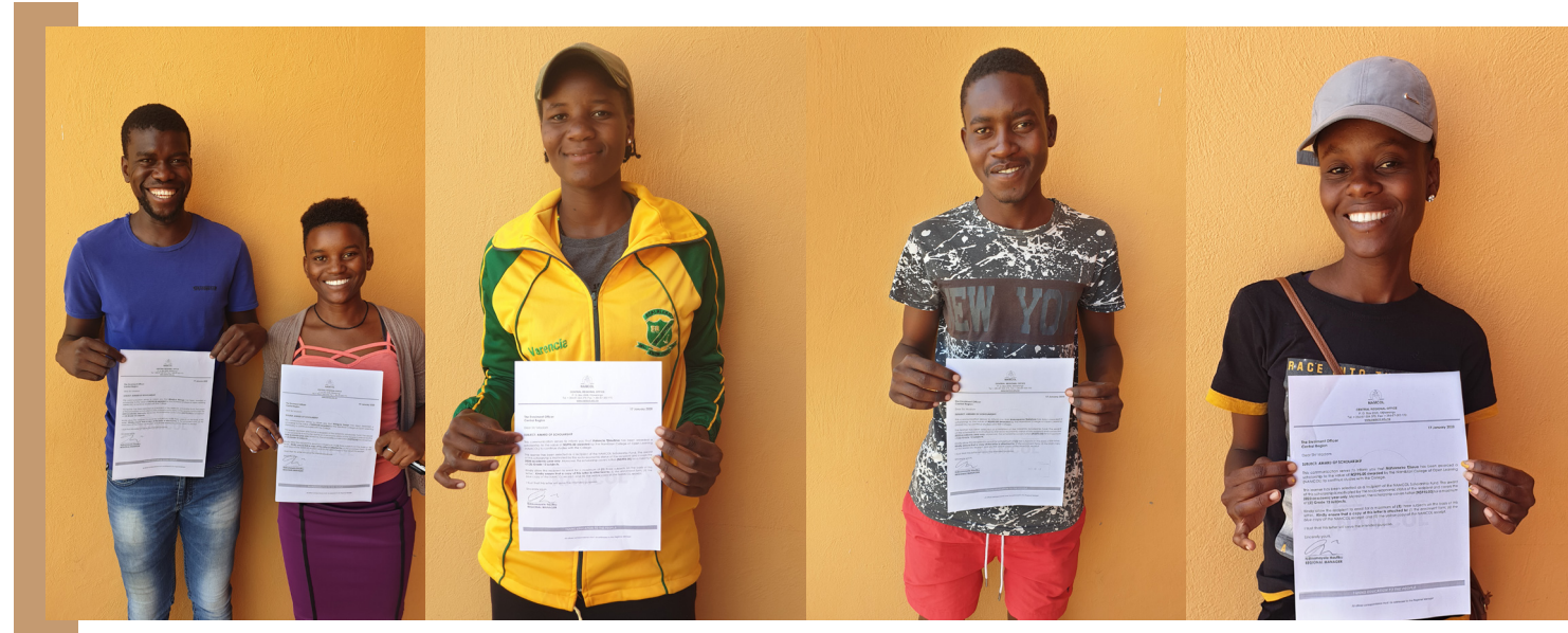
Pictures of a few learners amongst the 20 learners who were awarded the NAMCOL Scholarship.

Learners who had previously performed poorly in Grade 12, were granted the opportunity to improve their marks through the NAMCOL Scholarship Initiative.