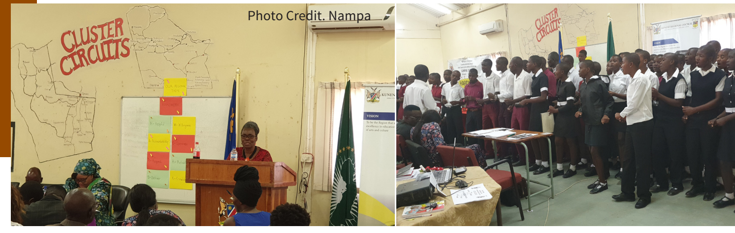
Hon. Ester Nghipondoka the Deputy Minister of Education Arts and Culture as she addresses the stakeholders in Kunene Region.