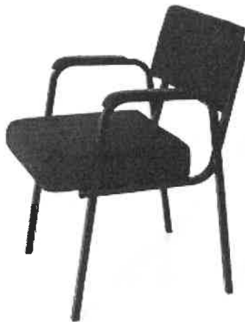
Teachers chair for lot 2