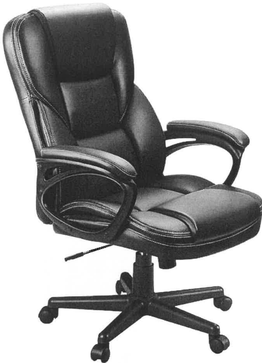
revolving chair in lot 1