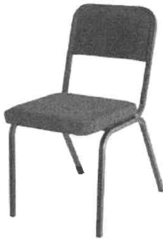
Chair for lot 1