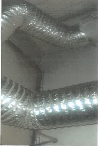
2. Dust extraction system