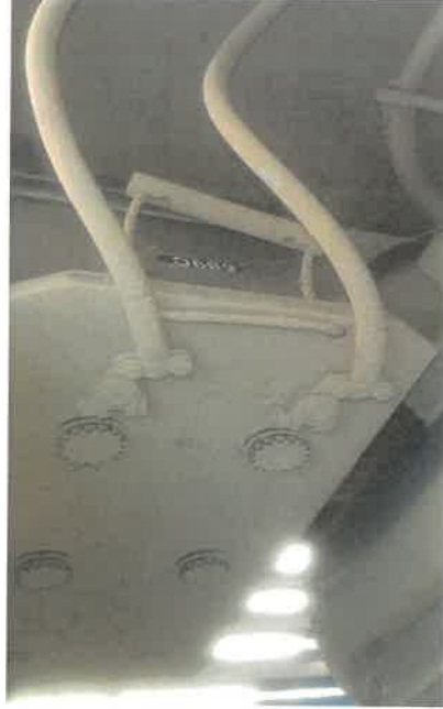
4. FNL 565/2 689C 12 V GENERATOR BATTERY