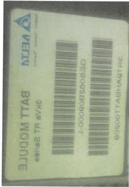
1. DELTA UPS